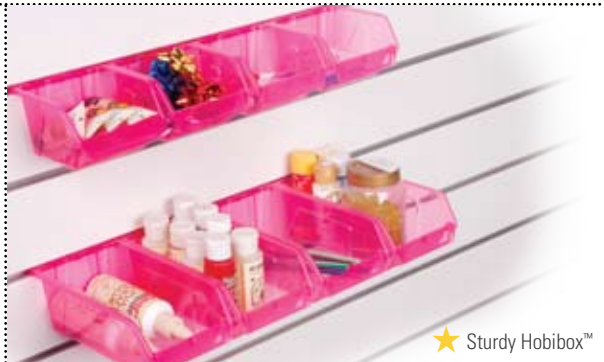
★ Sturdy Hobibox™

Combine with Slatbox™ Modular Slatgrid for a complete DIY storage solution.