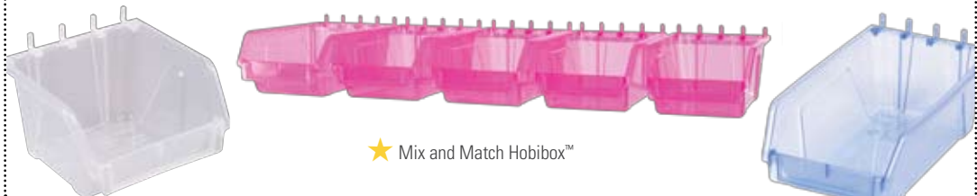
★ Mix and Match Hobibox™

The entire Slatbox™ range is compatible with existing store fixtures. Pick and choose from the exciting range of styles and colours to create the perfect storage system.