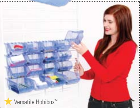
★ Versatile Hobibox™